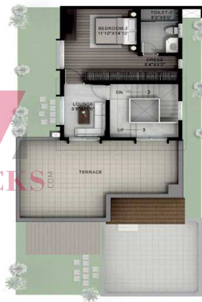
STAIRCASE ROOM FLOOR PLAN